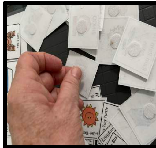
Put hard Velcro on the back of song choices